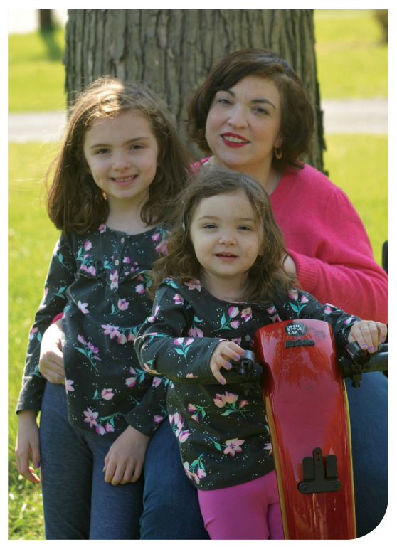
around what works best for your individual needs. For a parent with mobility issues, this might mean that rather than using one central changing table in the baby's room, changing stations would instead be positioned throughout the home. There's no reason that baskets or bags filled with diapers, a change of clothes and other essentials can't be placed in every room; one basket beside the bed, along with a bottle warmer or nursing sling, can help mothers more easily manage nighttime feedings.