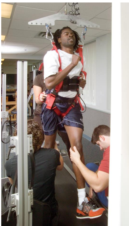
Figure 1: Locomotor Training at a Reeve NRN facility.

The following interventions will be discussed below: